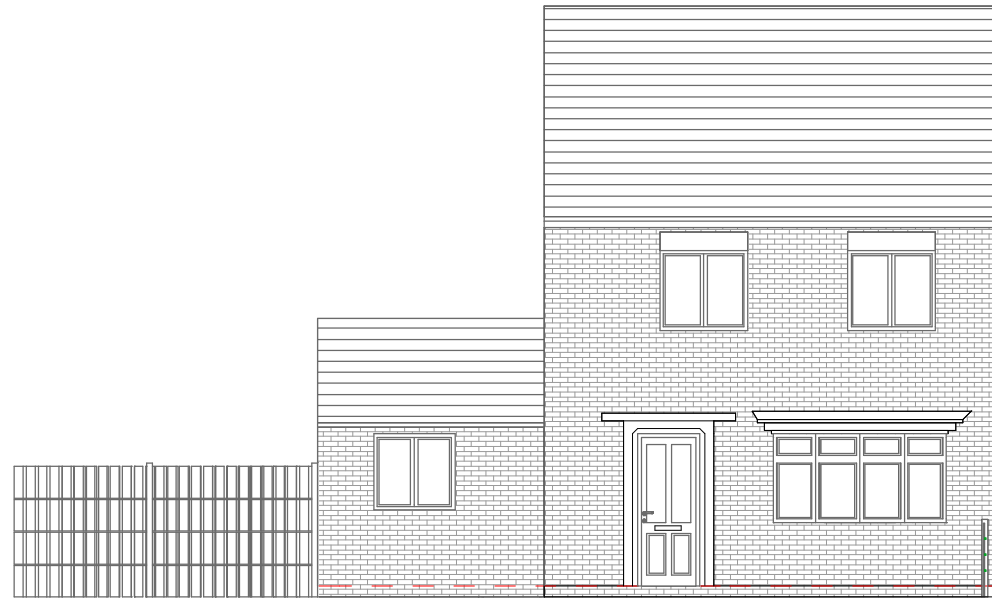
Proposed North East Elevation