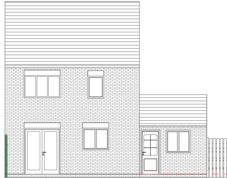
Proposed South West Elevation