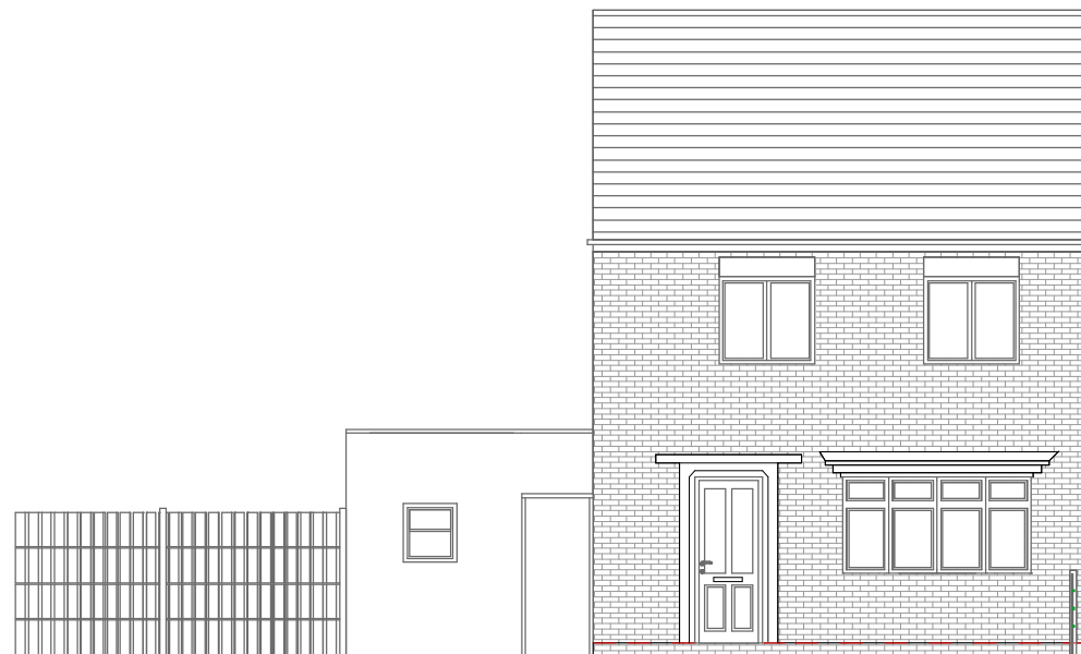
Existing North East Elevation