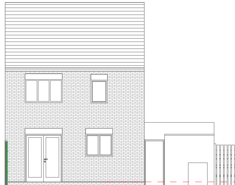
Existing South West Elevation